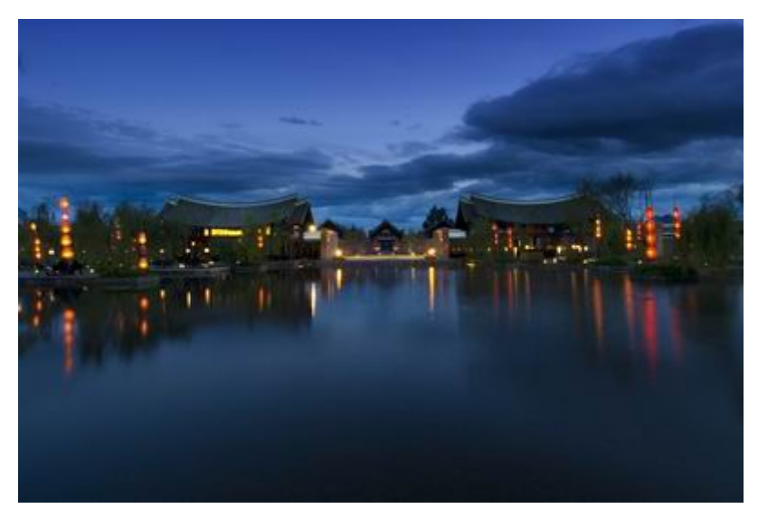
View of Banyan Tree spa hotels in China

As the twin brand of Banyan Tree, Angsa has been well-known by the Chinese market since the first entry of Banyan Tree group.